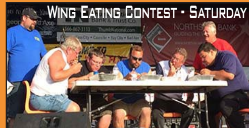
WING EATING CONTEST - SATURDAY

AREA TOURS Quarry - Friday • Farm - Saturday