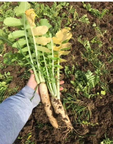
Above: Tillage radishes after growing for a month right before being worked into the soil.

Cover crops are just one way that farmers are taking care of the soil. We take care of the soil so that it takes care of us. Happy June!